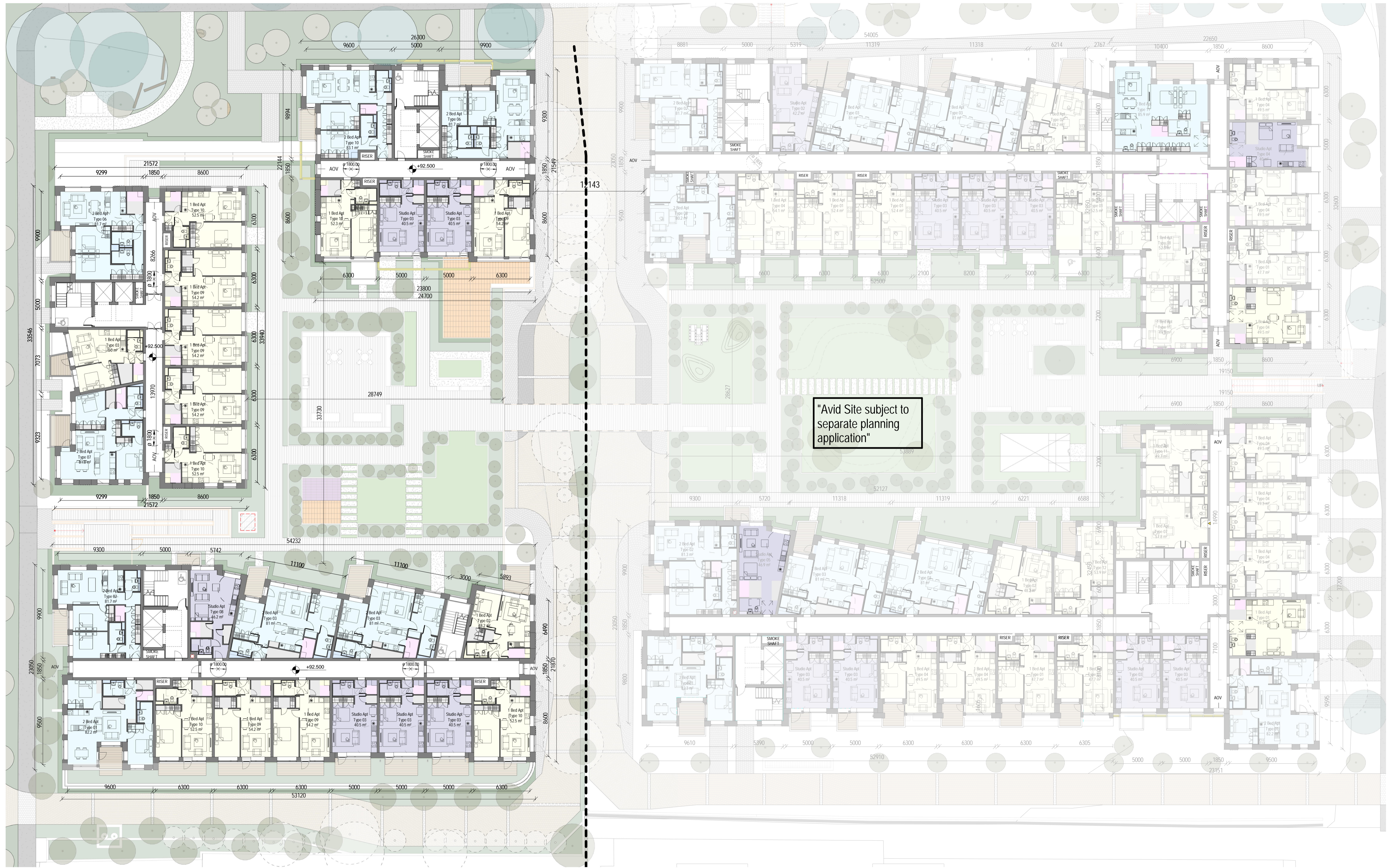
1 01 FLOOR - TACK SITE 90012